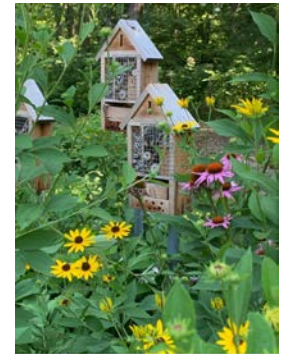
Pollinator garden with bee houses.