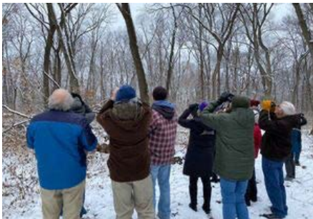
A sanctuary hike preceded the 2023 annual meeting.

Sightings at Adams included numerous woodpecker species, Red-tailed hawks and a Barred owl. Other SAS members added to the count with a variety of species spotted near the sanctuary’s Margery Adams House. This information has been submitted to the National Audubon Society to be included with data collected from across the U.S. and Canada as well as locations in the Caribbean, Latin America, and Pacific Islands. “Annual Summaries of the Christmas Bird Count, 1901-Present” can be found on the National Audubon Society website .