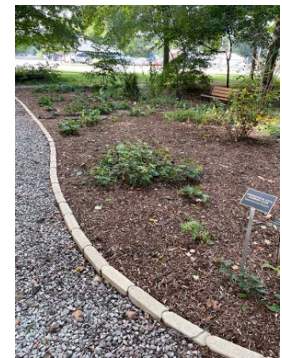
Shade garden with newly installed edging.