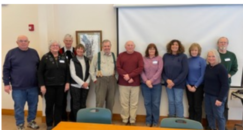
All SAS officers and board members were in attendance.