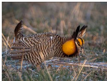
Greater Prairie-Chicken.

ILLINOIS AUDUBON SOCIETY ANNOUNCED in January that they have purchased 75 acres situated within the Prairie Ridge State Natural Area, located five miles southwest of Newton in Jasper county. Adjacent to the Robert Ridgway Grassland and adjoining IDNR lands, this tract provides continuity of grassland cover crucial to many grassland species. This acreage lies within the only area east of the Mississippi River where the Greater Prairie-Chicken can be found. The property will be restored, permanently protected, and eventually open for bird watching.