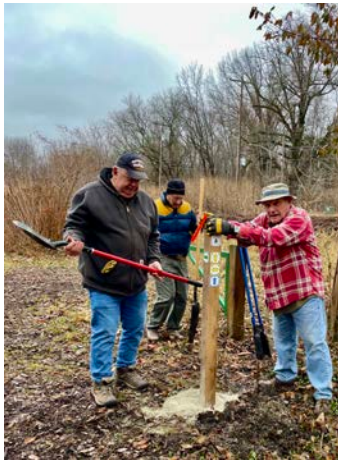
Volunteers replace damaged trail signs.

SPRINGFIELD AUDUBON SOCIETY PRESIDENT Mike Holinga reports that planning is entering the final stages for a sanctuary project that will create new storage, land steward office space, increased parking, a bus drop-off area, and a covered pavilion located near the Margery Adams House. Creation of new native landscape features, which will be both attractive and educational, are included in this project and will augment existing habitats of interest near the house such as the pollinator and shade gardens, which were installed and are maintained by sanctuary volunteers.