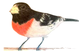
Rose-breasted Grosbeak.

Hikes begin at the parking lot of Adams Wildlife Sanctuary. They are free and open to the public.